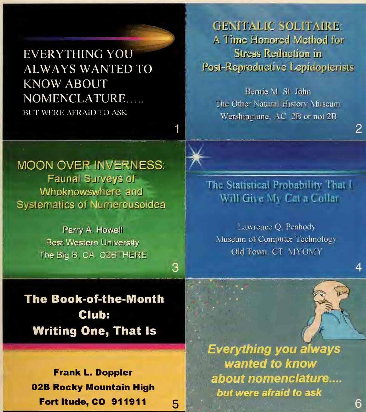
FIGS. 1-6. PowerPoint slides illustrating templates for various types of talks (see text for explanation).